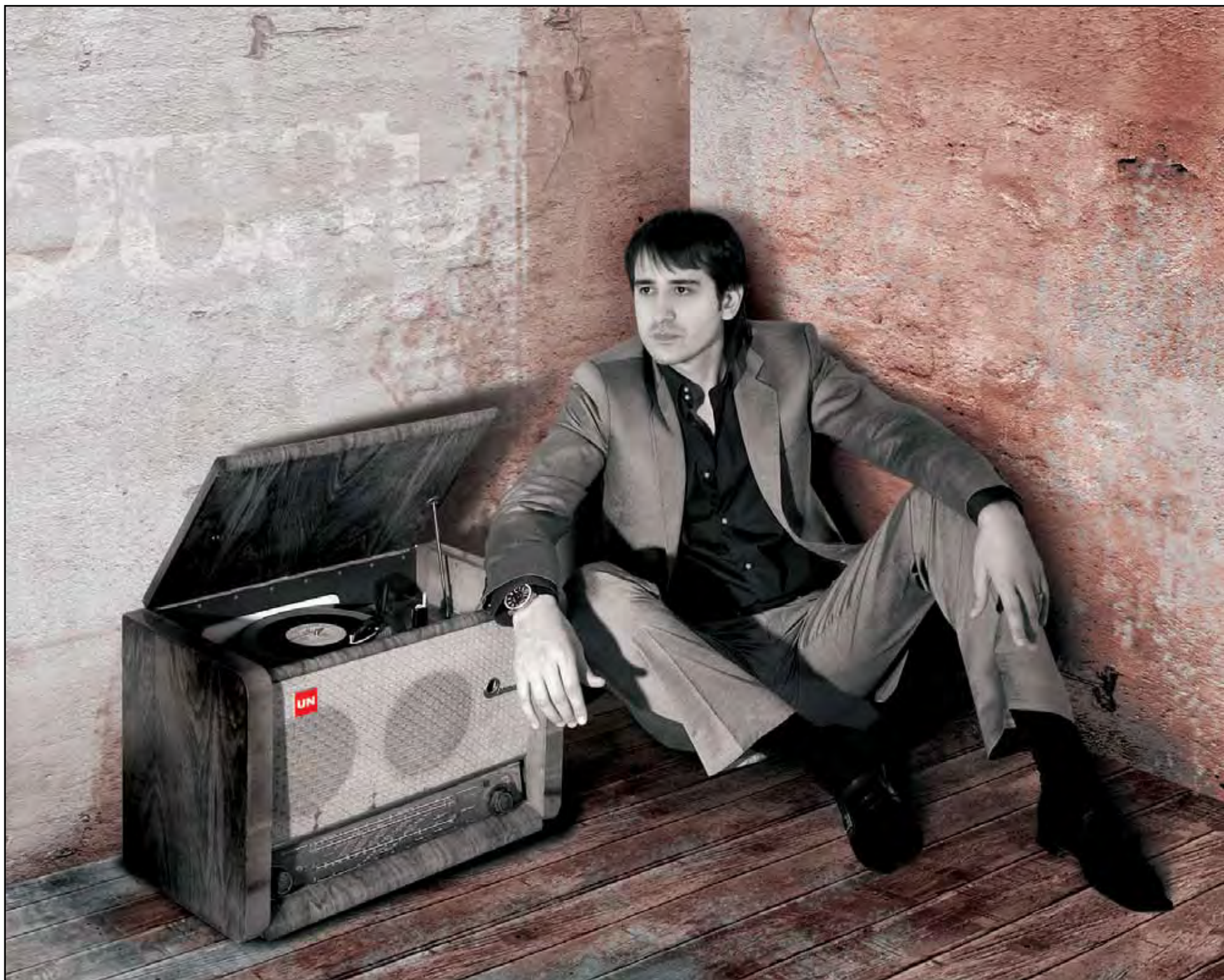
Arame.