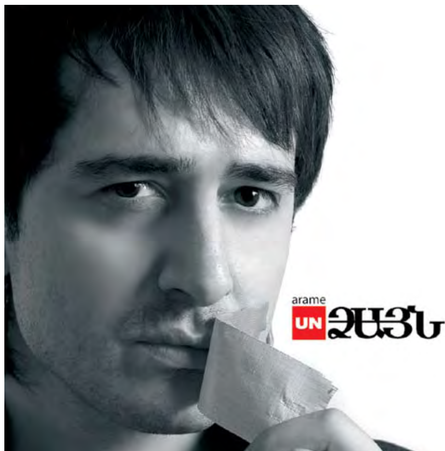
Arame's CD is titled Un-Dzain , or voiceless.