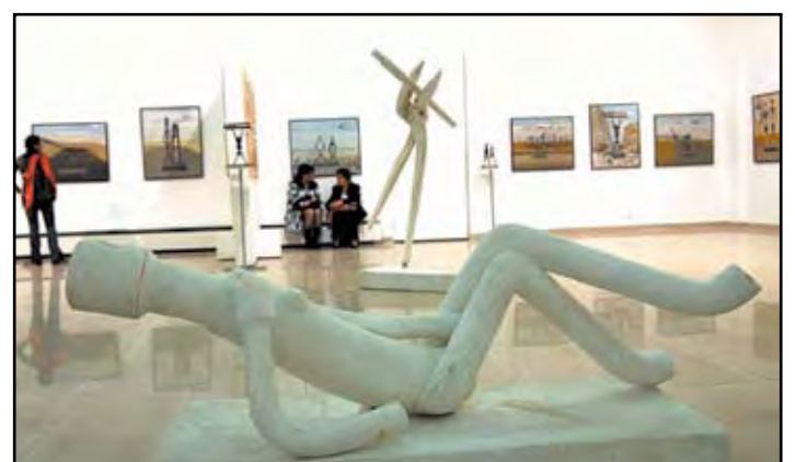
Scenes from Hakob Hakobyan's solo exhibition.