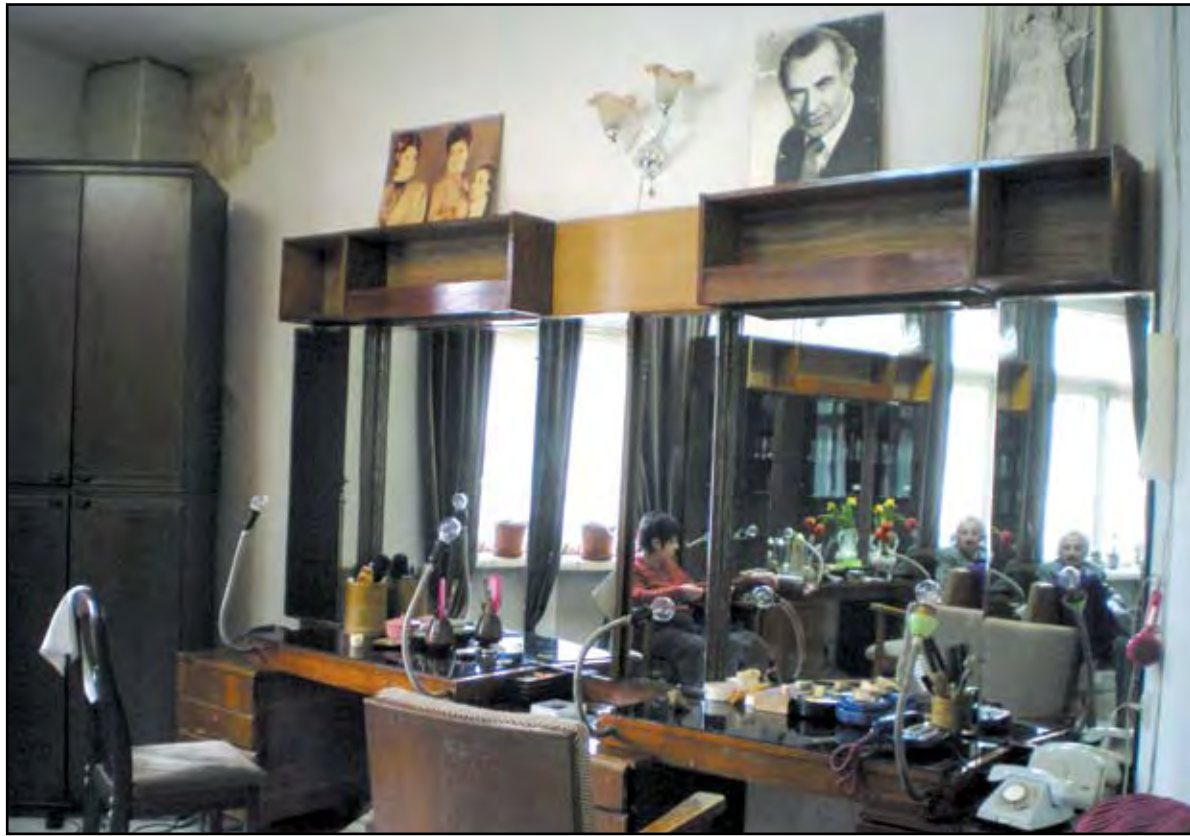
The make-up room at the Sundukian Theater.

Armenians have a rich history in the dramatic arts, dating back at least 3500 years to pagan times, when religious rituals themselves were theatrical performances. Centuries later, around 100 BC, the concept of theater in its more modern sense would begin to take root in Armenia, heavily influenced by Hellenistic culture.