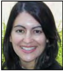
by Lory Bedikian

Poems of exile usually reveal themselves to us through their titles, through the opening lines, or often through the opening images of the verse. The poet creates a tone, a type of feeling that informs us that this is a poem of nostalgia, remembrance, and even, in some cases, a yearning of wanting to go back to one's homeland from which one was displaced.